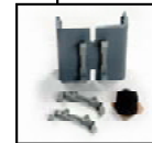
Shown with optional gauge

Optional DRC Kit for DIN Rail Mounting-Clips mount either direction on snap track