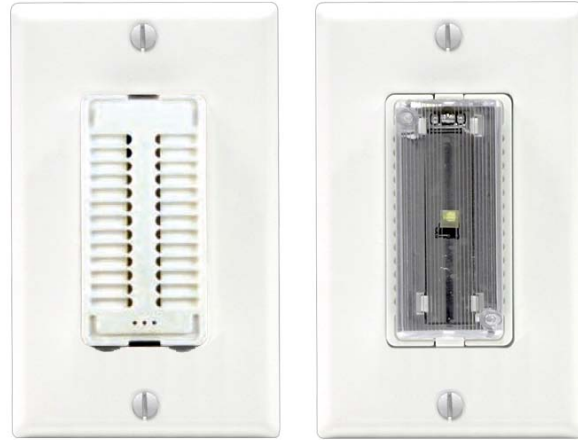
MSR-A & MSR-AV

For use with UL Listed 24VDC polarized power circuits.