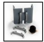
DRC DIN Rail Adapter